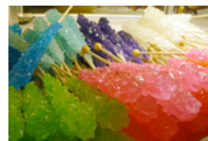
Rock candy is made from crystals of sugar.

It's easy to grow your own sugar crystals! Sugar crystals are also known as rock candy since the crystallized sucrose (table sugar) resembles rock crystals and because you can eat your finished product. You can grow beautiful clear sugar crystals with sugar and water or you can add food coloring to get colored crystals. It's simple, safe, and fun. Boiling water is required to dissolve the sugar, so adult supervision is recommended for this project.